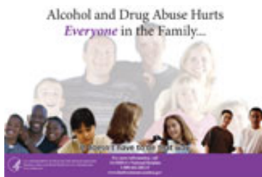
Alcohol and Drug Abuse Hurts Everyone in the Family...

Additionally, Substance Abuse and Mental Health Services Administration's Center for Substance Abuse Treatment has worked with NACoA to create a new poster and complementary pamphlets It Feels so Bad and Alcohol and Drug Addiction Happens in the Best of Families...and it Hurts designed for use in faith communities – especially as pick-up materials in pamphlet racks and in congregational offices and educational centers. Materials can be ordered from NCADI . The poster and pamphlets are also available in Spanish.