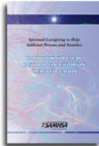
Spiritual Caregiving to Help Addicted Persons and Families Handbook For Use by Pastoral Counselors in Clergy Education