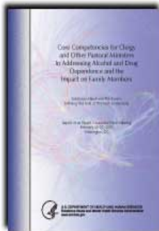
See the Core Competencies

We invite you to review the following documents. They are available in PDF format or you can order a free copy of the Core Competencies Booklet here . An order form to obtain free copies of the poster and pamphlets is shown below.